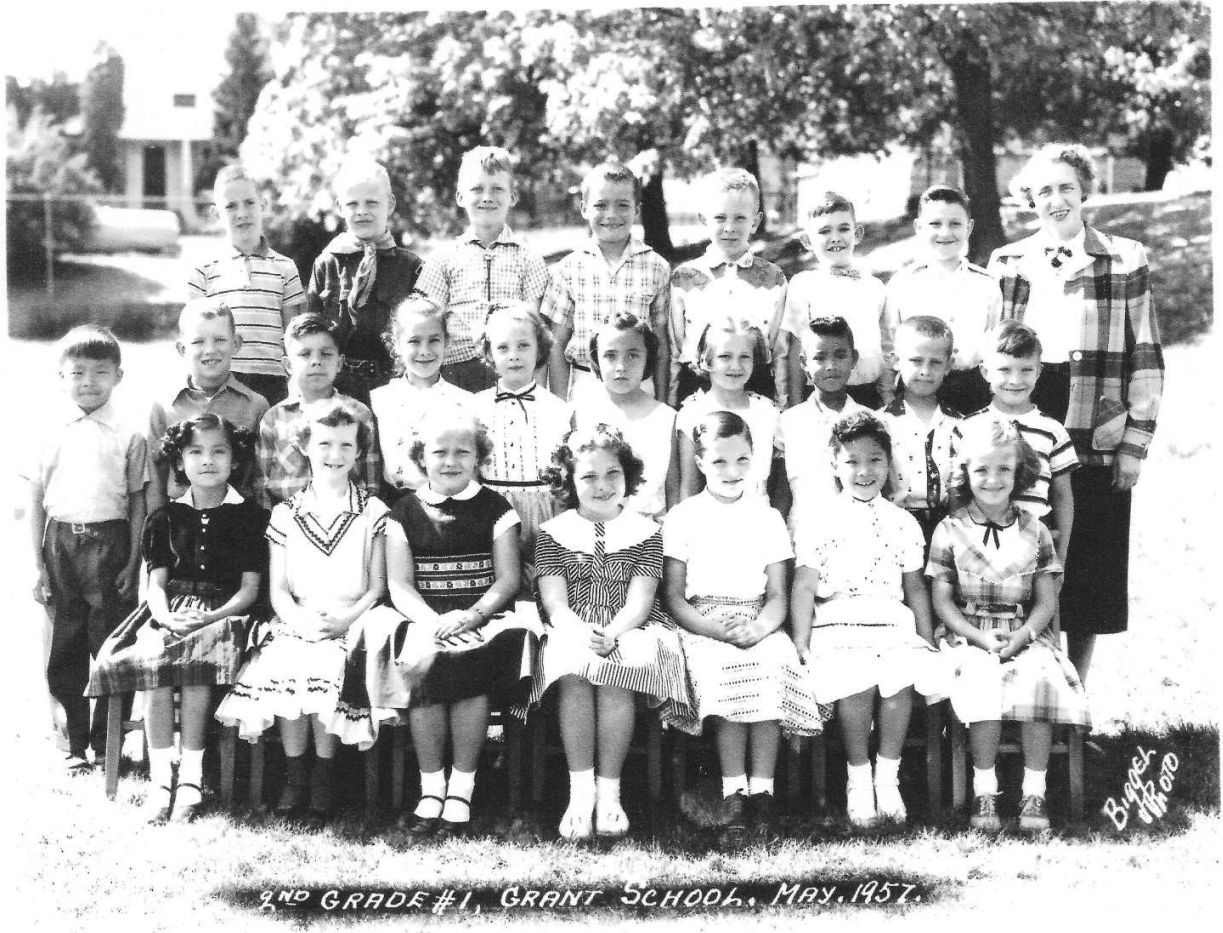
GRANT SCHOOL - Second Grade #1 - 1957 Class of 1963

At Timber Creek Grill Buffet in the Argonne Village, Montgomery and Argonne